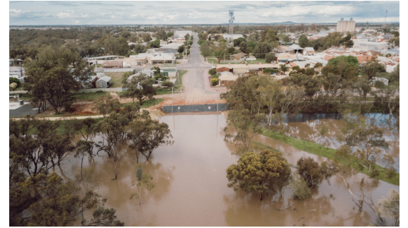
Donald Brenden Murphy 1mile2go photography